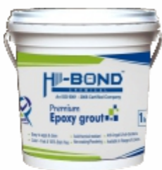
Available Packing 1 Kg., 5 Kg.