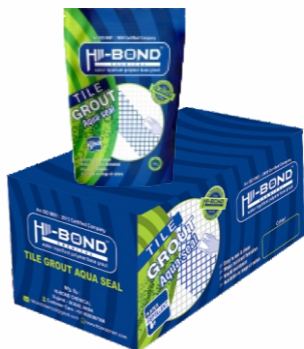
Available Packing 500 gm, 1 Kg.